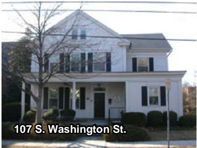
107 S. Washington St.