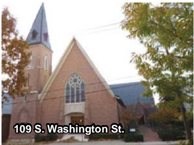
109 S. Washington St.