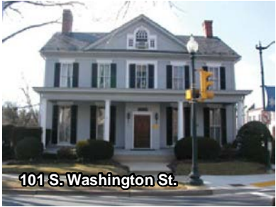
101 S. Washington St.