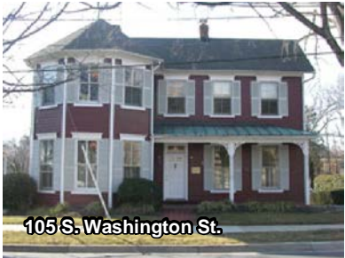
105 S. Washington St.