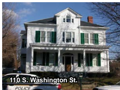
110 S. Washington St.