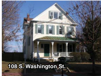
108 S. Washington St.