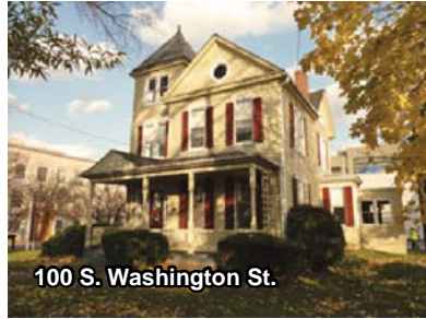
100 S. Washington St.