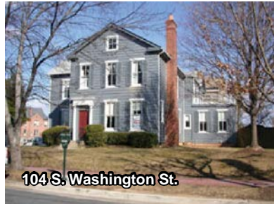
104 S. Washington St.